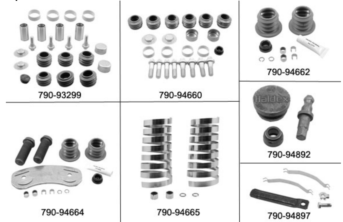
When ordering use (-) Example: 790-#####